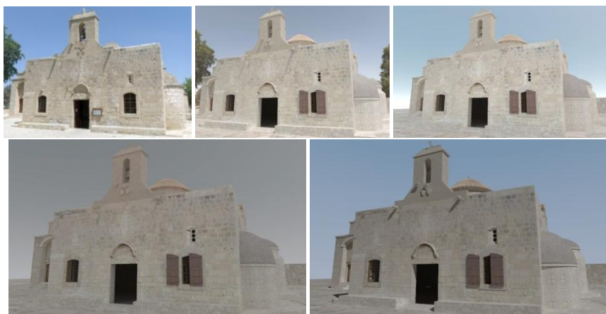
Fig. 6 Top left: photograph. Top middle: Image-based Lighting (captured from site). Top right: Preetham Sky Model [38]. Bottom left: CIE clear sky model. Bottom right: Directional light source mimicking the sun.

As new techniques and technologies develop, it is more likely that computational photography techniques will play a greater role in the future of virtual archaeology, particularly as these methods do not require objects to be touched, only that they are well-lit.