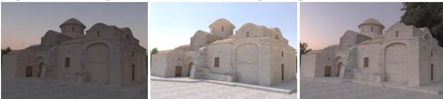
Fig. 5 Daylight simulation. Left: 06:30. Middle: noon. Right: 19:30