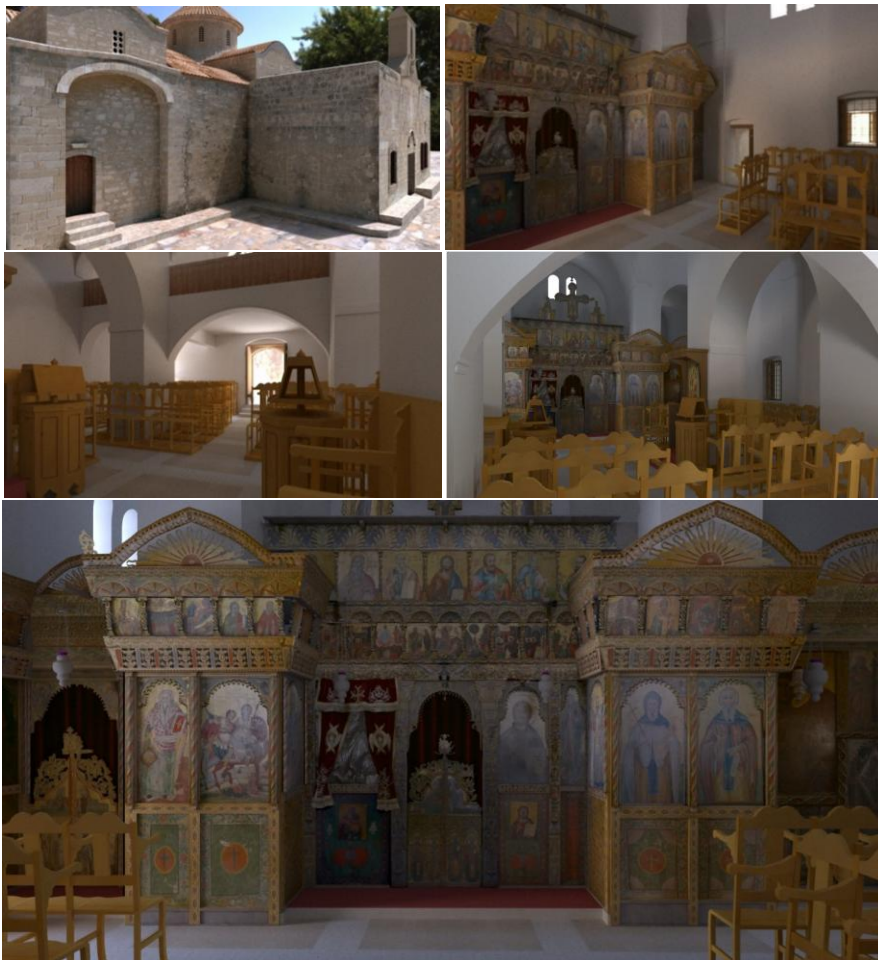
Fig. 4 Path tracing inside and outside Panagia Angeloktisti.