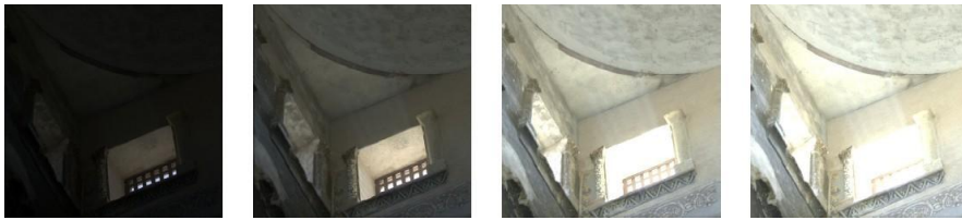
Fig. 3 Participating media (sun beams) at the Red Monastery in Egypt. The figure shows multiple exposures, from low to high exposure. We see that on lower exposures, the camera does not capture the sunbeams. HDR imaging captures all these ranges and assemble them into a single photograph for future examination.

photography has pushed cameras to reach greater bit-depth and image resolutions. Today, high-quality digital cameras are available with sensors capable of capturing 12-16 bits per colour channel. However, lower-quality digital cameras exist that are equipped with less expensive, lower-performing hardware with precision limited to 10 bits or even lower. Moreover, in many application there is the need to acquire much large dynamic range than the one covered by 12-16 bits sensors.