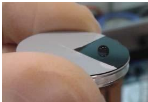
Fig. 1 De-wrinkled graphene sample collection prior to drying

to room temperature. Sample V was produced with 1 g of PVA and in the same manner like sample IV.