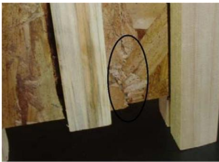
Fig. 8 OSB tore in shear near application line