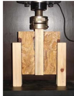
Fig. 7 Specimen in shear test machine

Tests were conducted until OSB web failure, and the failure mode was recorded. The objective of this test was to analyze if the web could slip in the flange joint when loaded, identifying the resin without adhesion or if the OSB web tore in shear. Fig. 7 shows the specimen in shear tests machine.