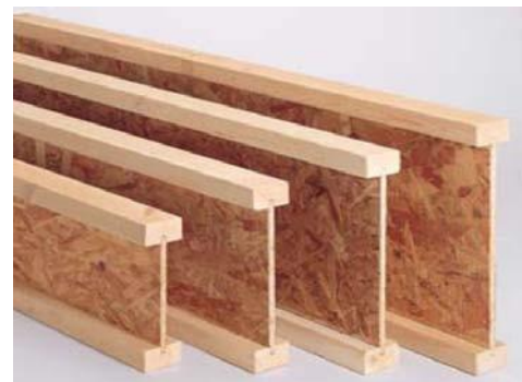
Fig. 1 Wood I-joists

Wood I beams can be manufactured with different dimensions and therefore different rigidities and strengths. In flexion, the flanges are subjected to axial forces and the web is subjected to shear stress, predominantly. Fig. 1 shows some beams with different heights [1].