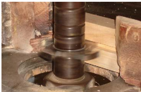
Fig. 4 Mortising machine producing the rectangular groove

The flanges were selected by obtaining a material with a minimum of imperfection and tested on the flexural modulus, density and humidity control between 12 to 14%, like Brazilian Code “NBR 7190 – Design of Timber Structures” [11]. Epoxy based resins were applied with spatula because of the consistency and Resorcinol-Formaldehyde were applied with paint-brush.