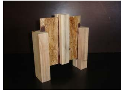
Fig. 6 Web-to-flange joint specimen with reinforcement

To prevent OSB crushing, the web was reinforced on both sides with pieces of solid wood of Pinus taeda glued onto the OSB with the same resin used in connection. Fig. 6 shows the web-to-flange joint specimen with reinforcement.