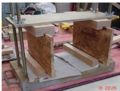
Fig. 5 Specimens on pressing apparatus

To ensure a perfect union in web-to-flange joint, the specimens were pressed, as shown in Fig. 5.