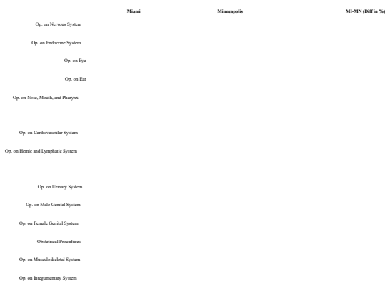
Fig. 1 Surgical Procedure Codes by Facility Type Capability Map for Miami, Minneapolis and the difference between them

1) and MS-DRG by Facility Type (Fig. 4).