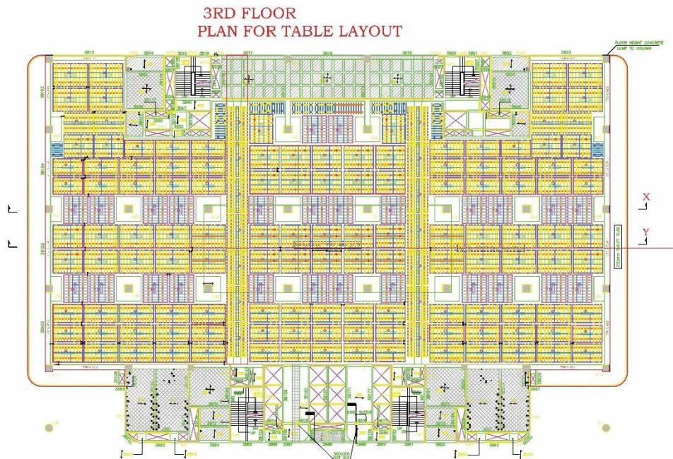
Figure 2: Typical floor H-Beam and Table Formwork Layout